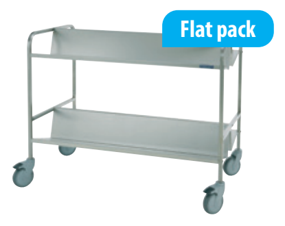
Plate cassette trolley Metos PCT-12low FP

Product number 4554530 Product name Cassette trolley PCT-12low FP 5ize mm (w * d * h) 1010 * 630 * 900 Weight 35,500KG Capacity 12 plate cassettes