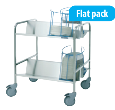
Plate cassette trolley Metos PCT-8 FP

Product number 4554420 Product name Cassette trolley PCT-8 FP Size mm (w * d * h) 765 * 630 * 900 Weight 25,100KG Capacity 8 plate cassettes, Ø28 cm