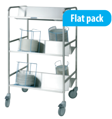
Plate cassette trolley Metos PCT-12 FP

Product number 4554422 Product name Cassette trolley PCT-12 FP Size mm (w*d*h) 765 * 630 * 1300 Weight 35,500KG