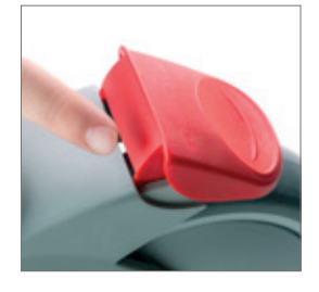
Unique protection against finger injuries and dirt (100 and 125 mm).