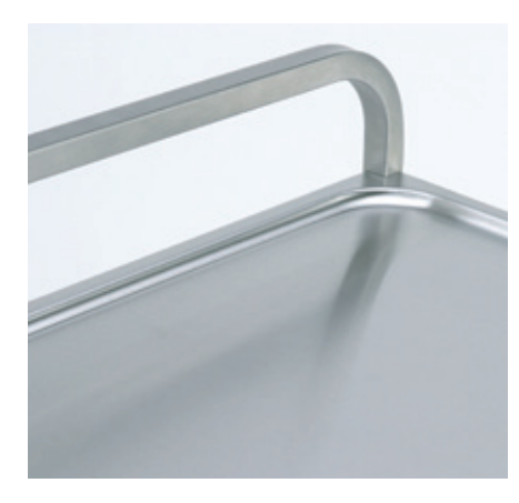
Fitted with sound dampeners under the surface, the trolleys are quiet when needed in hotel, banqueting and hospital environments.

Polyurethane running slides – no cut fingers for staff, no bending or warping from heavy use.