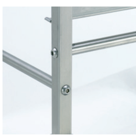
Ergonomical benefit with raised handles. The running slides have basket stops to prevent baskets from sliding while moving trolley.