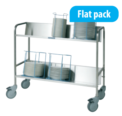
Plate cassette trolley Metos PCT-6 FP

Product number 4554418 Product name Cassette trolley PCT-6 FP Size mm (w * d * h) 1010 * 415 * 900 Weight 21,500KG Capacity 6 plate cassettes, Ø28 cm