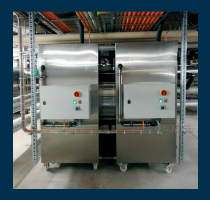
Several units can be connected to same system, if there is plenty of kettles to be cooled.